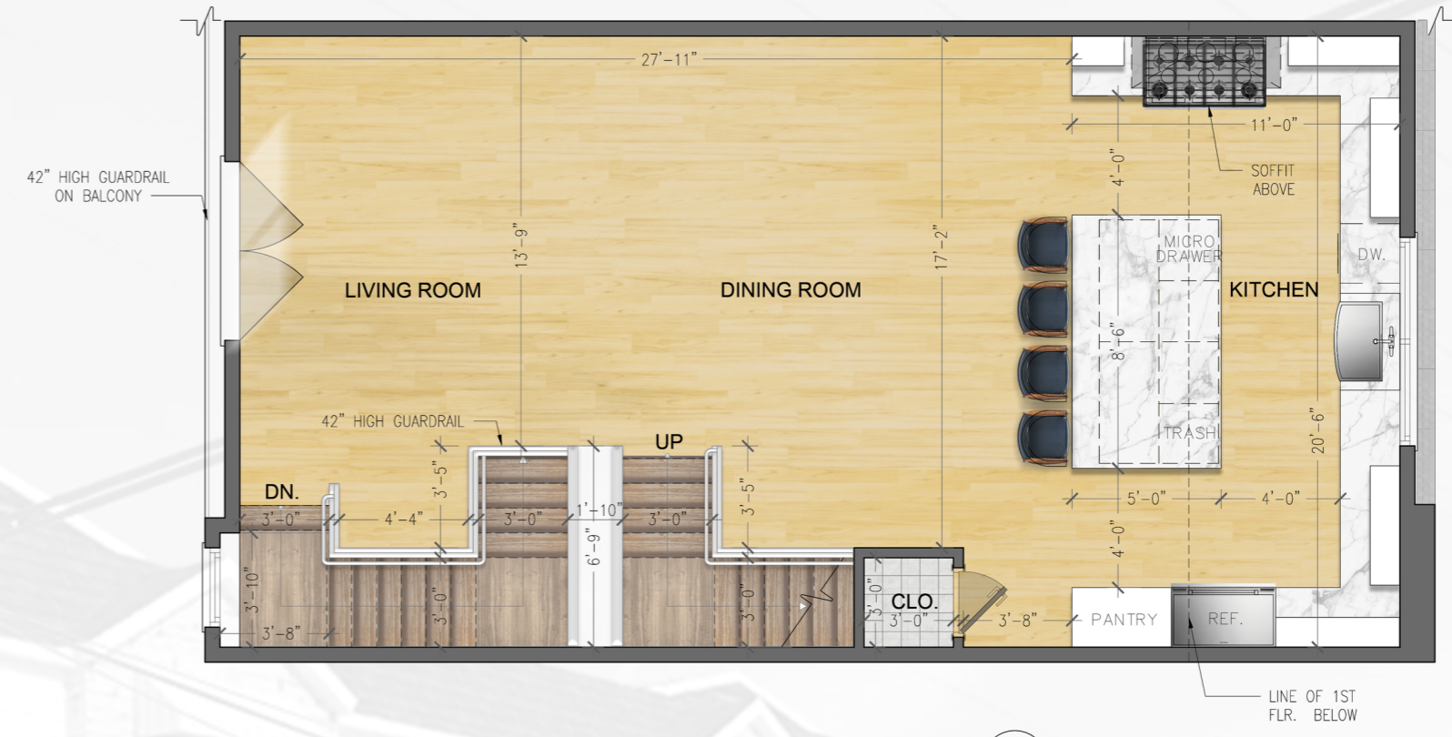
2 SECOND FLOOR PLAN WEST BUILDING