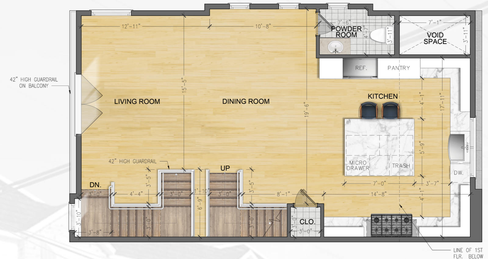
2 SECOND FLOOR PLAN WEST BUILDING